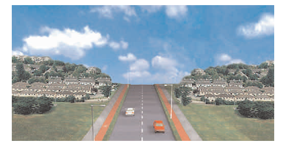
Standard 2 lane urban environment

The manual describes six levels of service from A (best) to F (worst). In the Road Needs Study the Authority's objective for road planning purposes was to achieve a minimum LOS of D, equivalent to an 80kph inter-urban journey speed on the network. This was in keeping generally with the LOS objective defined in the Operational Programme for Transport (OPT), 1994-1999.